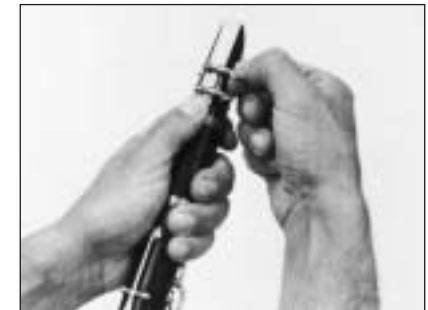
Do not "over-tighten" ligature

Place the ligature on the mouthpiece with your right hand so that the screws are over the reed. Position the reed so that it is on the middle of the facing. The position of the reed on the mouthpiece has a great effect on the way the instrument plays. Be careful when placing the ligature over the reed so that the reed is not chipped.