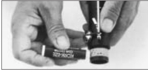
Greasing Tenon Cork.

Your clarinet is made in five parts. These are (from top to bottom): mouthpiece, barrel, upper joint, lower joint, and bell. Care must be taken in assembling these parts to prevent damage. The parts are held firmly together by means of tenon corks.