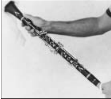
Do not forget to swab

The clarinet should be dried before it is put into the case. Hold the clarinet with the bell up. Drop the string of the clarinet swab into the bell so the weight comes through the barrel joint. Draw the swab through the clarinet. A soft, absorbent swab should be used. Repeat until bore is dry.